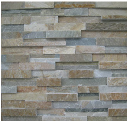
Artistic - Beige Blend