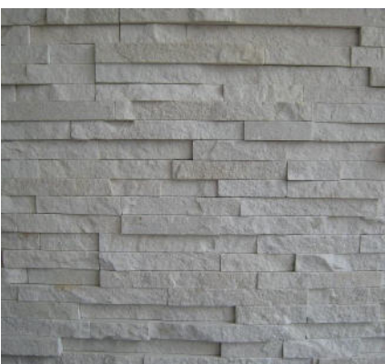
Artistic - Glacier White