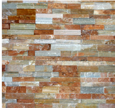
Classic - Maple Gold