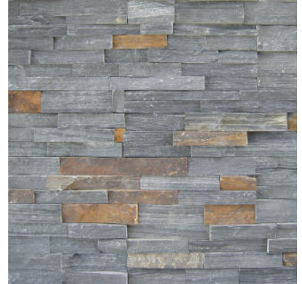
Classic - Smoky Mountain