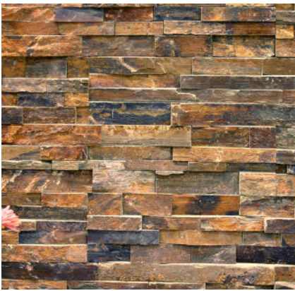
Classic - Autumn Red

Accessories: Corners, columns, cap, matching color flagstone, tile and pool coping available.