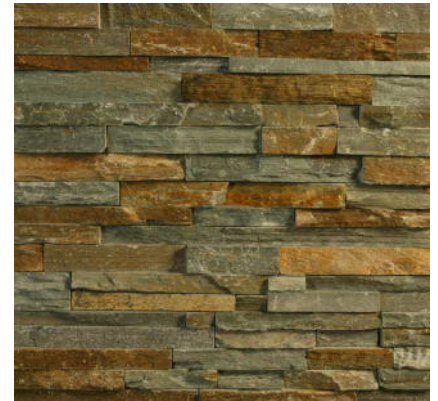
Classic - Lake Louis