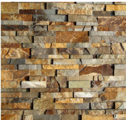
Artistic - Tan Brown